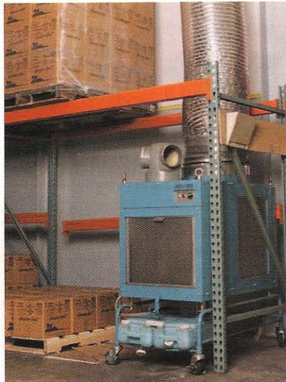
MovinCool's portable air conditioners spot-cool hot areas in Hawaiian Host's shipping department.

Air Reps Hawaii visited the factory and showed how the portability and all-in-one design of MovinCool spot air-conditioners made them the ideal cooling solution for virtually any heat-related problem. Hawaiian Host bought their first MovinCool unit in 1996 and